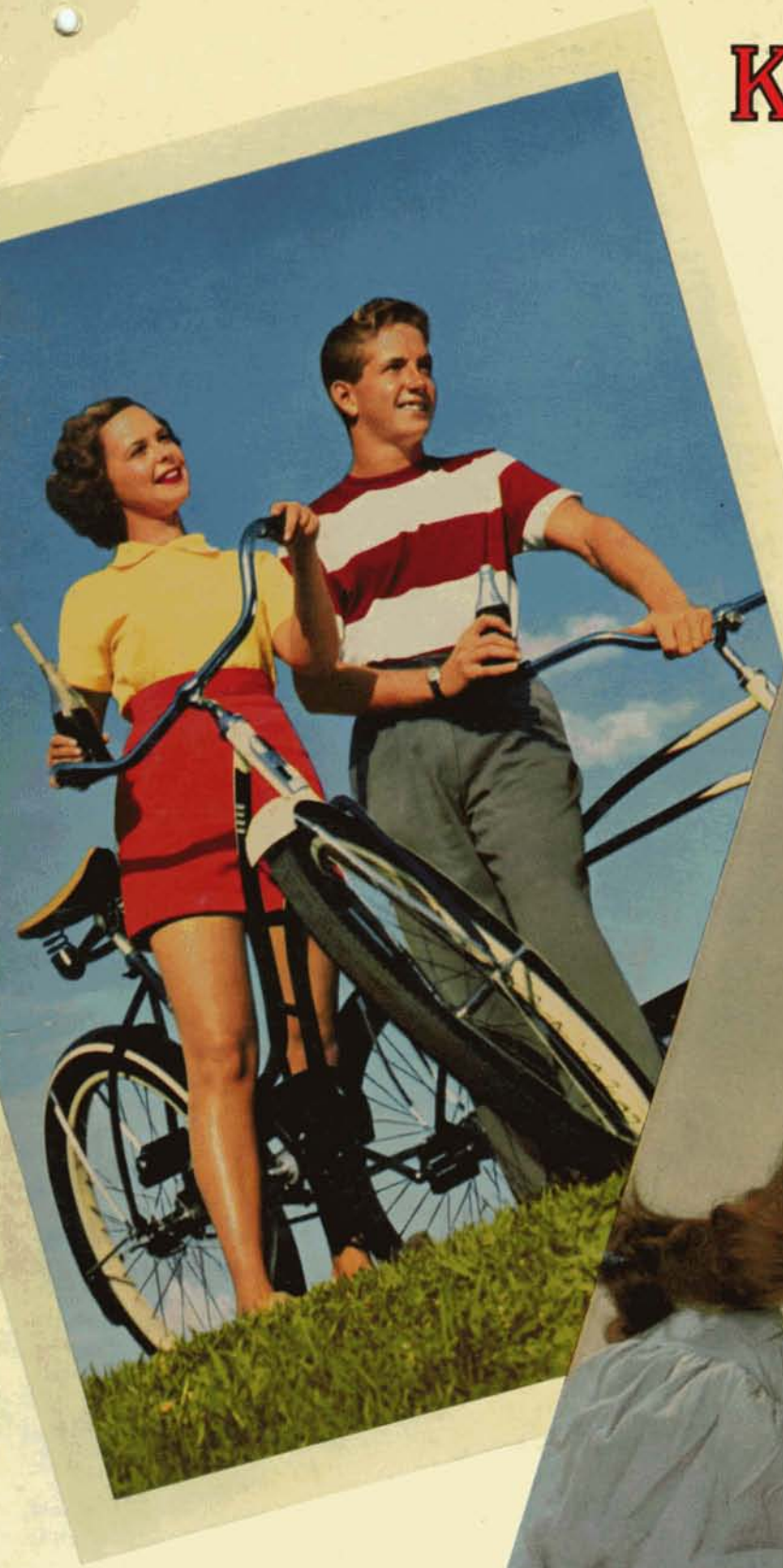
Reproduction of Kodachrome Enlargement 5 x 7