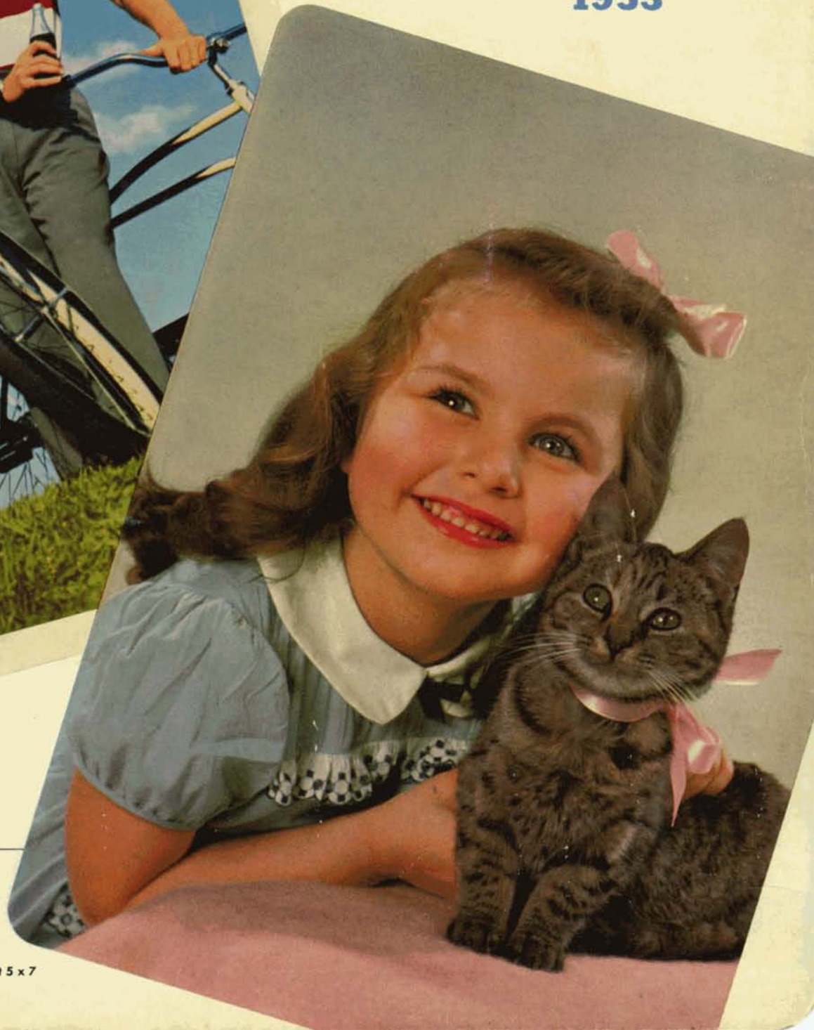
Reproduction of Kodachrome Enlargement 5 x 7